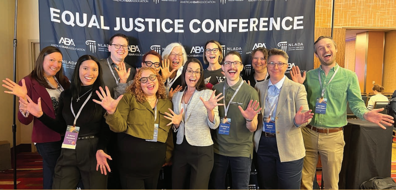
Colorado attendees at 2025 Equal Justice Conference in San Francisco, California.